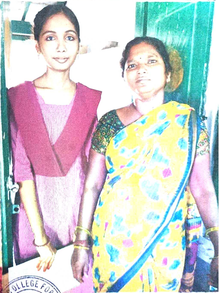
Principal Y.A. Govt. Degree College for Women CHIRALA, Bapatla., (A.P.)