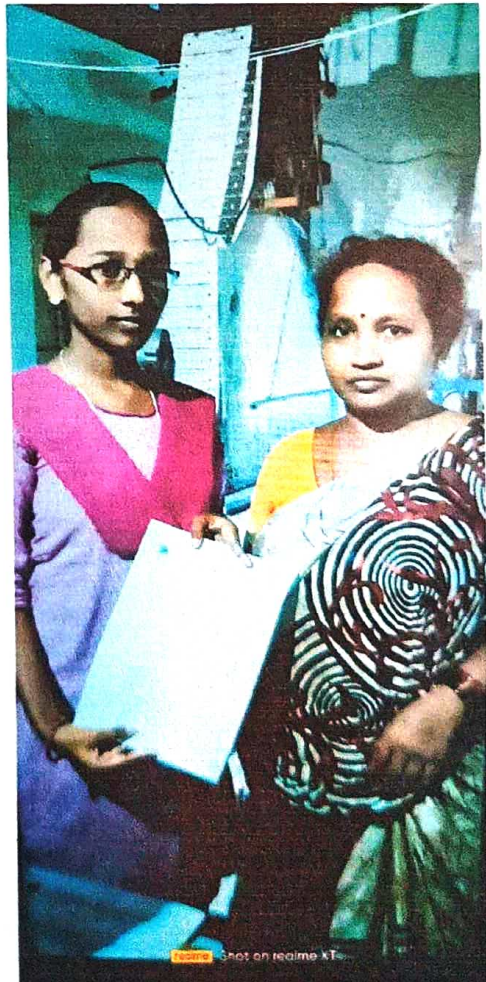
Shot on realme XT