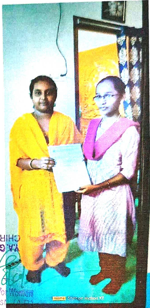
Shot on realme XT

Principal Y.A. Govt. Degree College for Women CHIRALA, Praksam Dist.