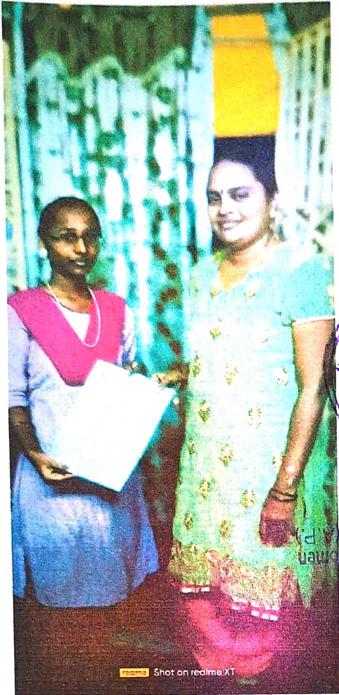
Shot on realme XT