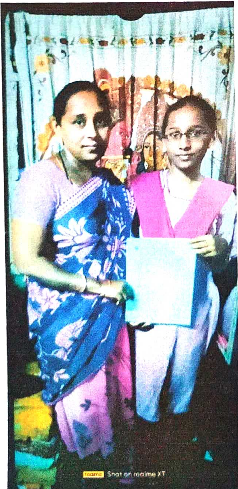
Shot on realme XT